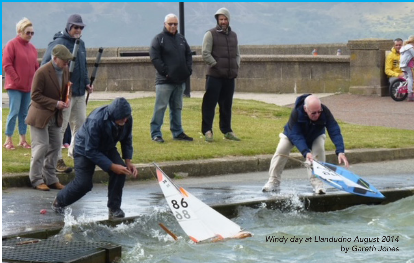
Windy day at Llandudno August 2014