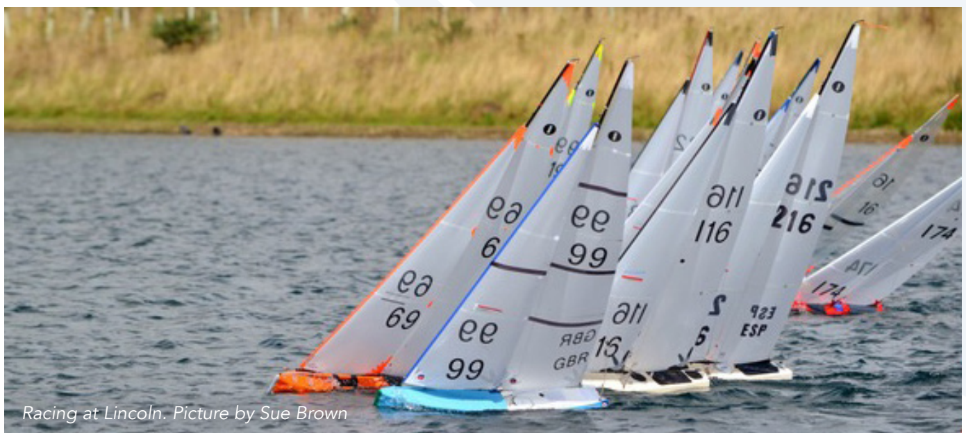
Racing at Lincoln.