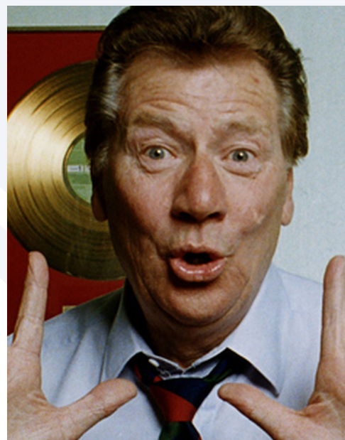
the late, great Max Bygraves